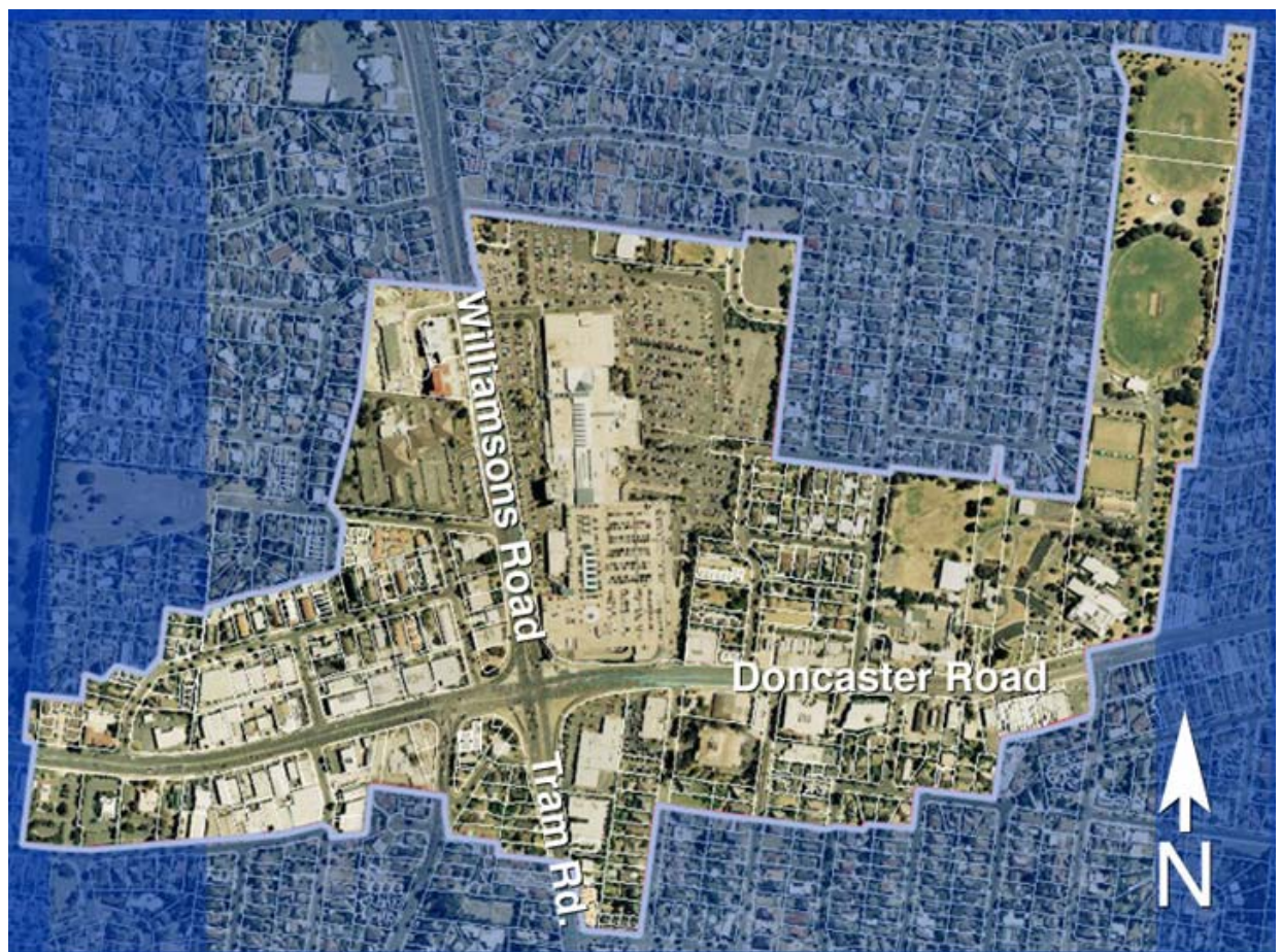
Figure 1: Doncaster Hill Activity Centre - Aerial Photograph

Key elements of the centre are the Manningham municipal offices at the centre's eastern end, with Shrams Reserve to its north and Doncaster Primary School to its west, Westfield's, Doncaster Shoppingtown (currently undergoing a $600m refit) is at the north-east corner of Williamsons and Doncaster Roads and the high rise Sovereign Point and Crest apartments are located on Williamsons Road, opposite Westfield.